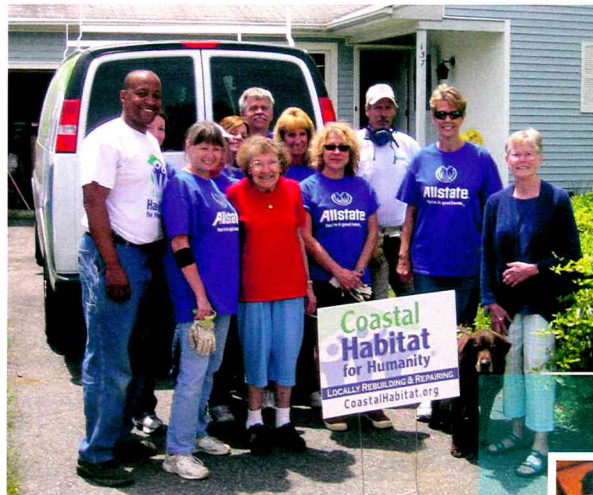
COASTAL HABITAT’S programs assist people from all backgrounds, including seniors and veterans.

Congressional Commendations from Representatives CHRIS SMITH (District 4) and FRANK PALLONE (District 6).