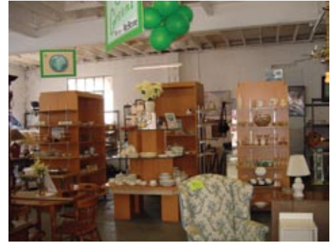
A corner of the newly organized ReStore, with revamped displays and a more efficient layout.

"Tell friends, neighbors, church members, and everyone you know at community organizations about us. A lot of people have heard of the ReStore, but they don't know what it is we do there, so the best thing is to get out there and tell everyone. Tell people what it is we do, how we do it, and how it helps both Habitat and the community. Tell them, if anything, to come and just spend ten minutes looking around."