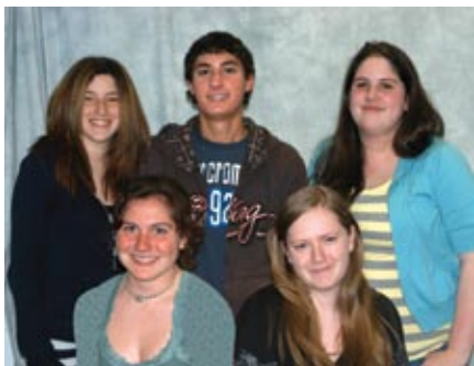
The Habitat student marketing team, five talented Communications High School students.