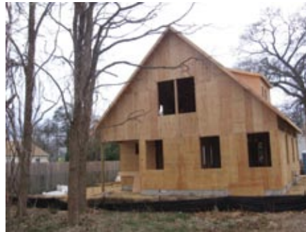
The outline of a sturdy Cape Cod begins to take shape on 18th Avenue in Wall.

Our current building project in Wall is unprecedented in many ways. It's our first project being built in the town and the family is the largest that we've built for. Designed by prominent local architect